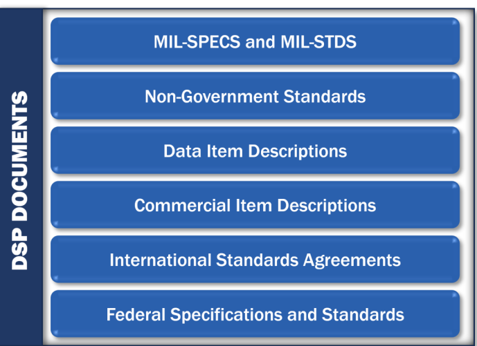
DSPO provides DoD standardization policy, procedures, tools, and training to standards users and more than 100 standardization management activities across the Department